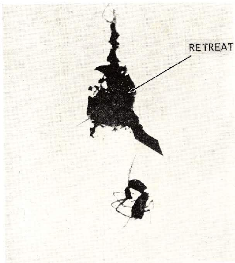
Figure 2. Mature female Diguetia albolineata wrapping a cockroach.

Holding the freed prey in its chelicerae, the spider carried it to the retreat, entered the mouth of the retreat, turned 180^{\circ} , and began to eat facing downward. If another victim fell onto the platform the spider's first reaction was often to attach a line to the platform near the retreat. It then attached this line to the prey being eaten, and slowly rotated the prey so that several loops of thread were placed around it (almost everything diguetids do associated with spinning is quite slow and clumsy when compared with the orb